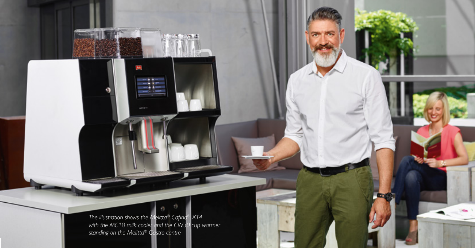
The illustration shows the Melitta® Cafina® XT4 with the MC18 milk cooler and the CW30 cup warmer standing on the Melitta® Gastro centre